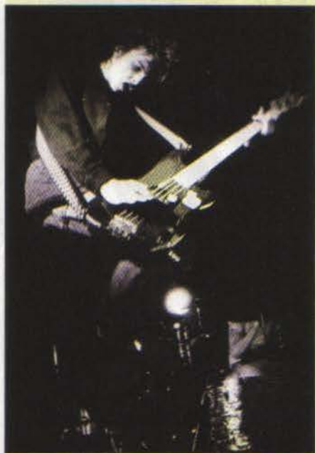
Tommy Stinson hits a high note with the Replacements