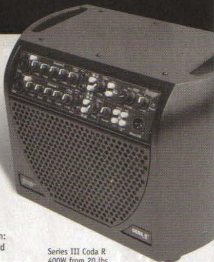
Series III Coda R 400W from 20 lbs.

Acoustic Image Musical Amplification: Setting The Standard